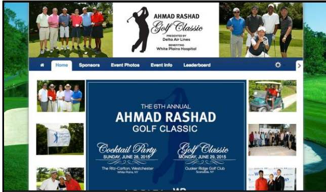
Examples of event and league websites